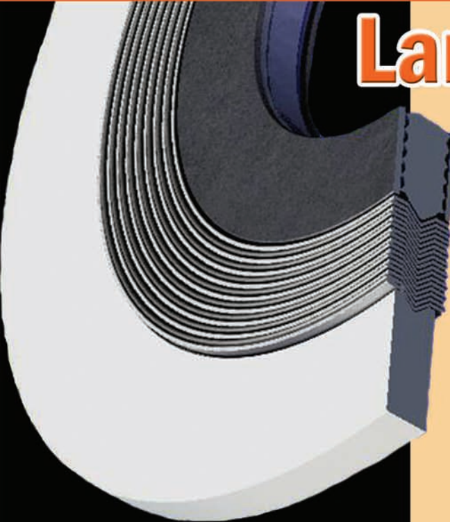
Traditional spiral wound gasket utilizing an inner ring resulting in severe flange corrosion